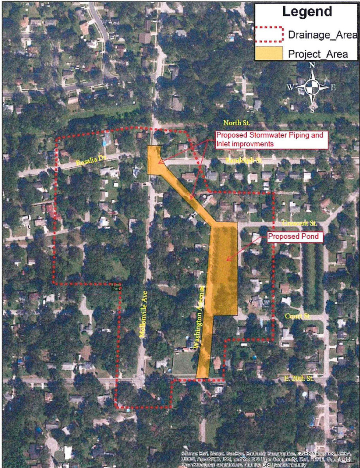
Figure 1: Location Map – Washington Pond and Stormwater Improvements